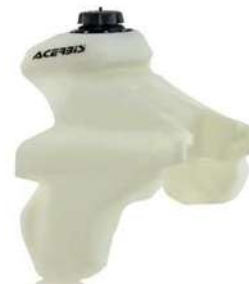
HUSQVARNA FC 250/350/450 year: 2016/2017 capacity: 12 lit. code: 0021872.120.700