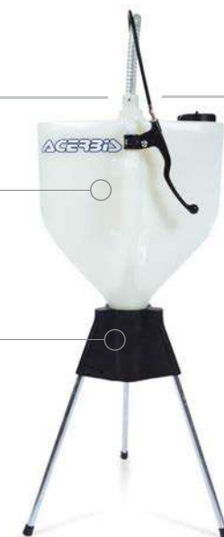
QUICK FILL STAND code: 0000099.