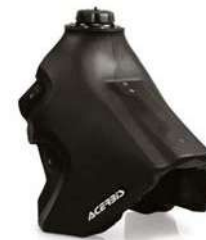
KAWASAKI KLX 400 year: 2003/2004 capacity: 14 lit. code: 001604.090.