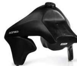
KAWASAKI KLX 450 year: 2004 capacity: 16 lit. code: 0012438.090.700