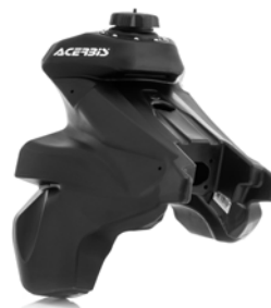
HUSQVARNA FC 250/350/450 year: 2016/2017 capacity: 12 lit. code: 0021872.090.700