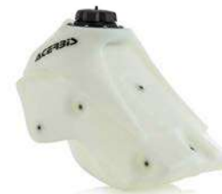
KAWASAKI KXF 250 year: 2017 capacity: 11 lit. code: 0022566.120.700