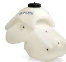
KAWASAKI KLX 450 year: 2006/2008 capacity: 12,5 lit. code: 0011673.120.700