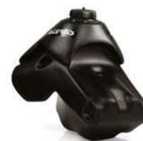
KAWASAKI KLX 450 year: 2008/2018 capacity: 12,5 lit. code: 0011602.090.700