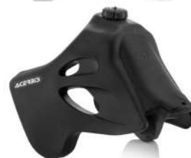
KAWASAKI KLX 250 C/R year: 93/96 capacity: 14 lit. code: 0001594.090