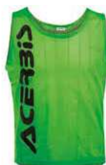
green code: .130