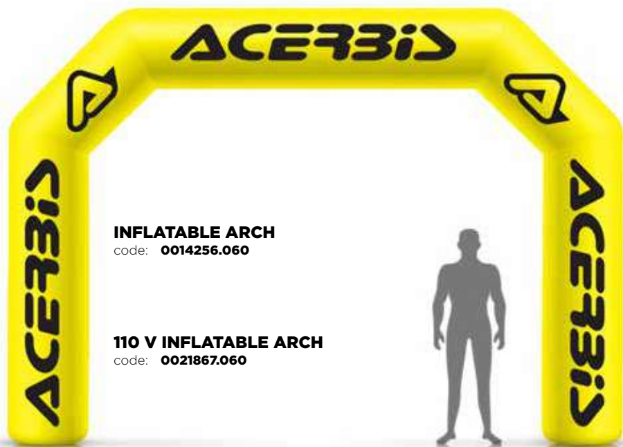
INFLATABLE ARCH code: 0014256.060