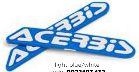
light blue/white code: 0022497.432