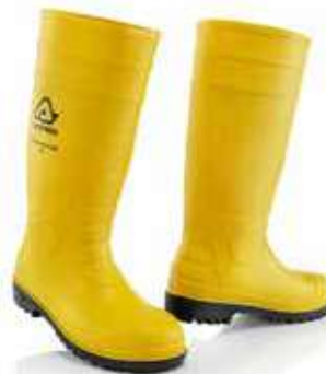
OOSET BOOTS code: 0023859.060 sizes from 40 to 47