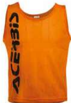
orange code: .010