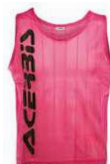
fucsia code: .141