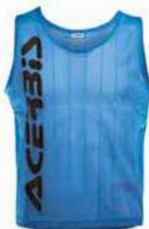
fluo light blue code: .047