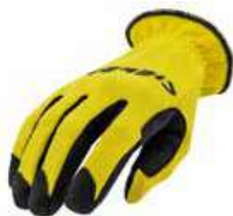
MECHANIC BUT code: 0023827.279