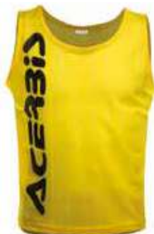
yellow code: .060